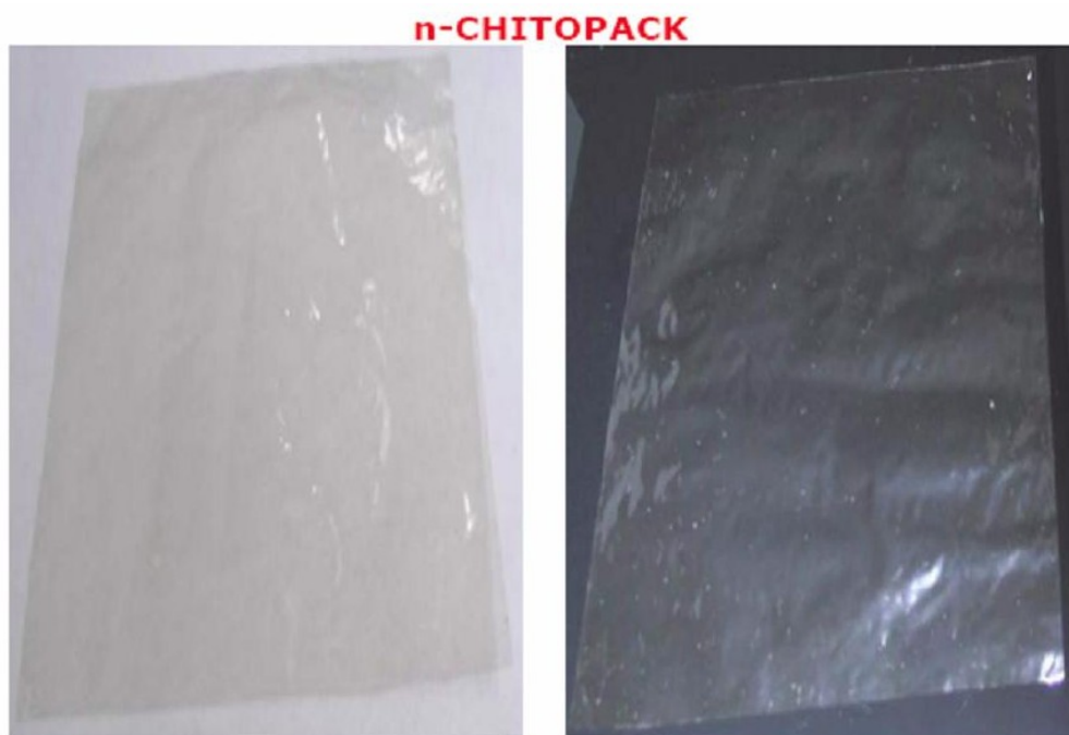
Figure 3. Chitin nanofibrils advanced medication obtained by electrospinning technology.

From an economical point of view, nanotechnology is a growing market, representing almost 1,300 products that are being commercialized (Roco et al. 2011). The market of nanotechnology-based products reached $254 billion in 2009 and is expected to rise to $1 trillion worldwide by 2015. The market of natural products in Europe is projected to grow towards €250 billion by 2020, while the regenerative medicine field that is based on nanotechnological ingredients is estimated to have a worldwide market of $500 billion, according to the US Department of Health and Health Services (Bu & Callaway 2011, Mantovani et al. 2010). On the other hand the actual world demand for food containers is higher than $15 billion.